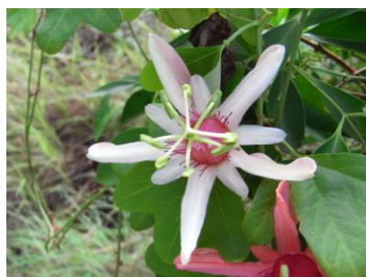
← Passiflora aurantia